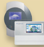
Solar-Log 500/1000™ and Meteocontrol WEB'log Comfort Accessories