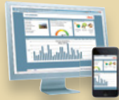
StecaGrid Portal Web porta